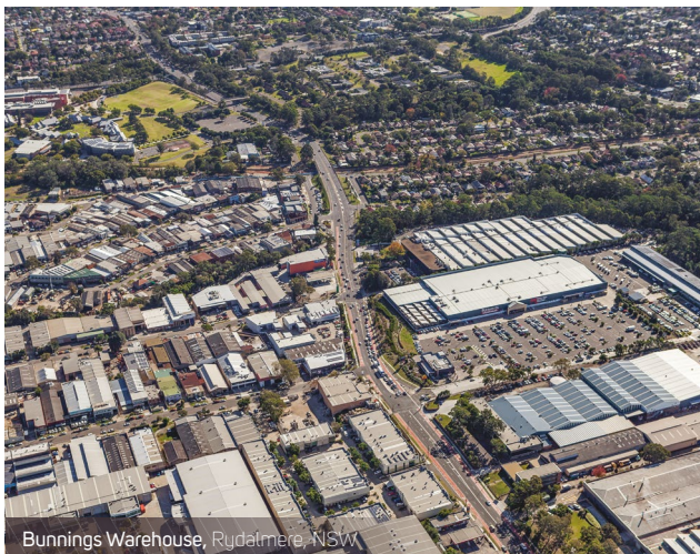
Bunnings Warehouse, Rydalmere, NSW