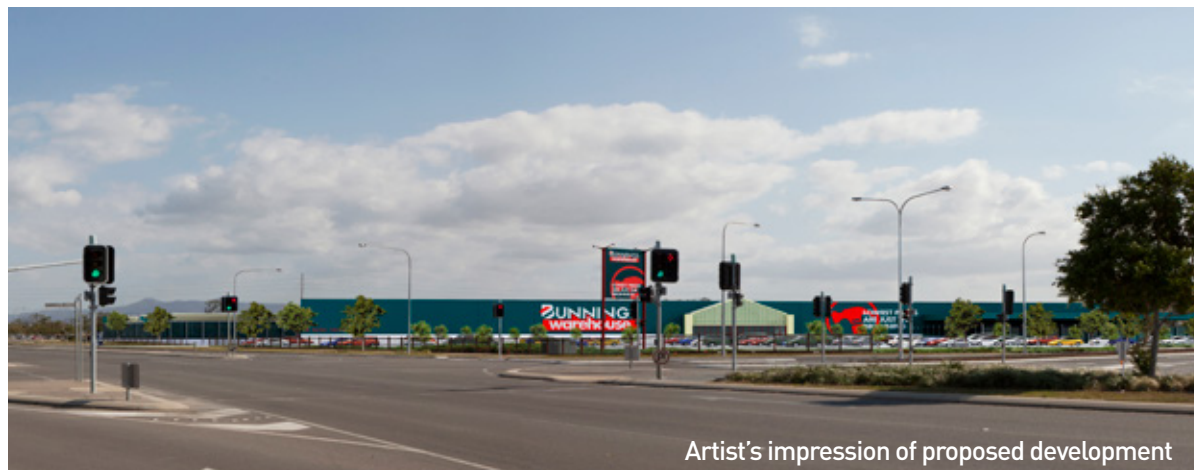
Artist's impression of proposed development

8 North Shore Boulevard, Burdell, Queensland