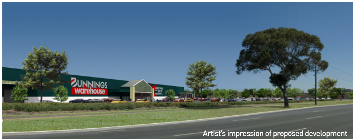
Artist's impression of proposed development

849-857 Princes Highway , Springvale, Victoria