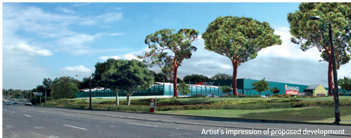
Artist's impression of proposed development

300-320 Victoria Road, Rydalmere, New South Wales