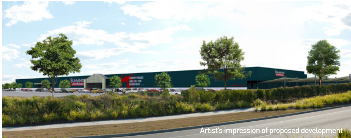
Artist's impression of proposed development

2 Flinders Parade, North Lakes, Queensland