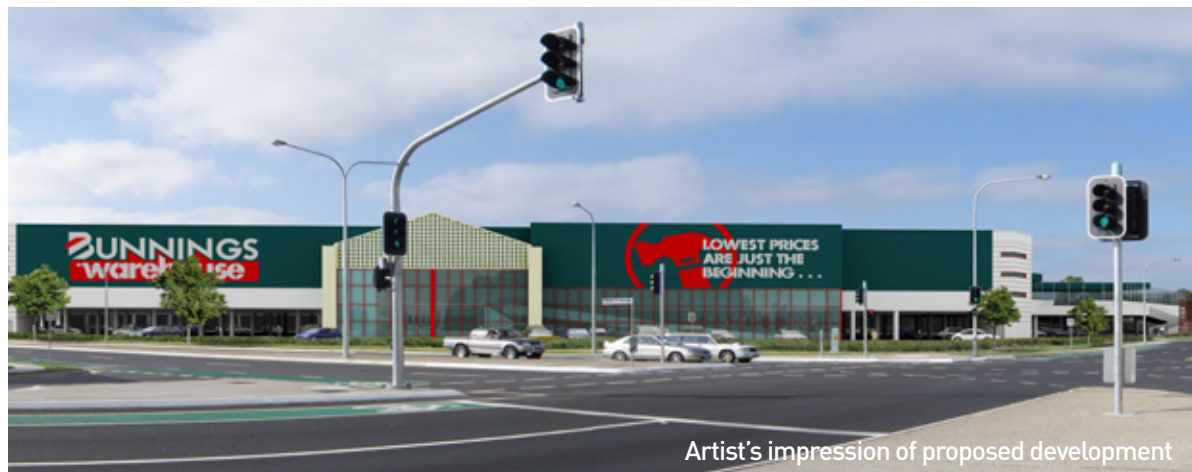
Artist's impression of proposed development

398 Wondall Road, Manly West, Queensland