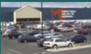
Cover: Vermont South, Victoria.